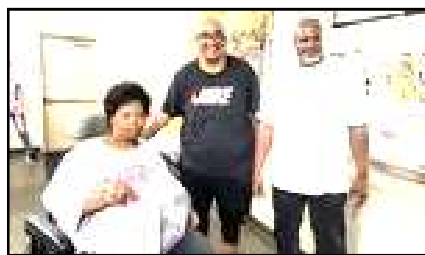
A GODTEL resident with men From Stonewall Baptist Church

Stonewall Baptist Church donates food every first Sunday of the month. For Mothers' Day, they brought little purses for all the ladies at our Nacogdoches mission.